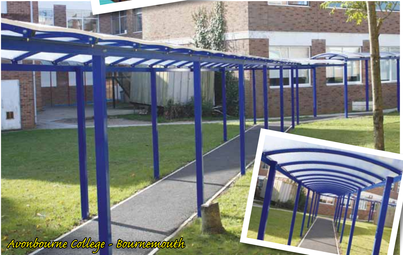
Avonbourne College - Bournemouth