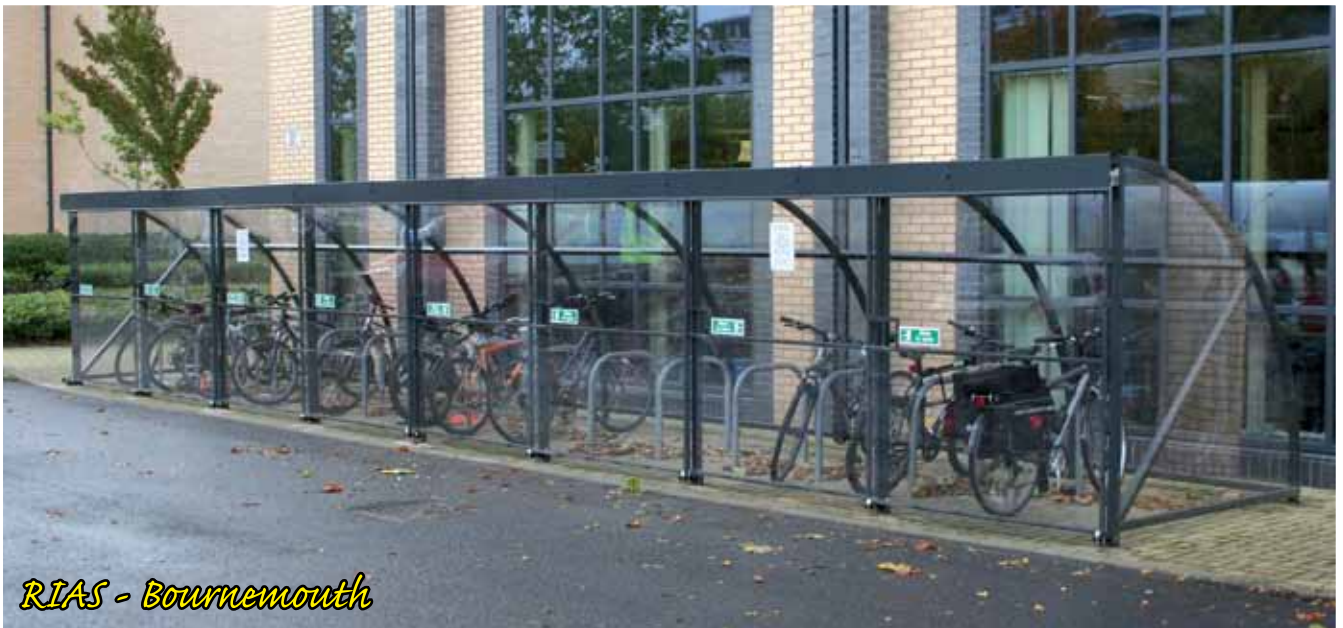
RIAS - Bournemouth