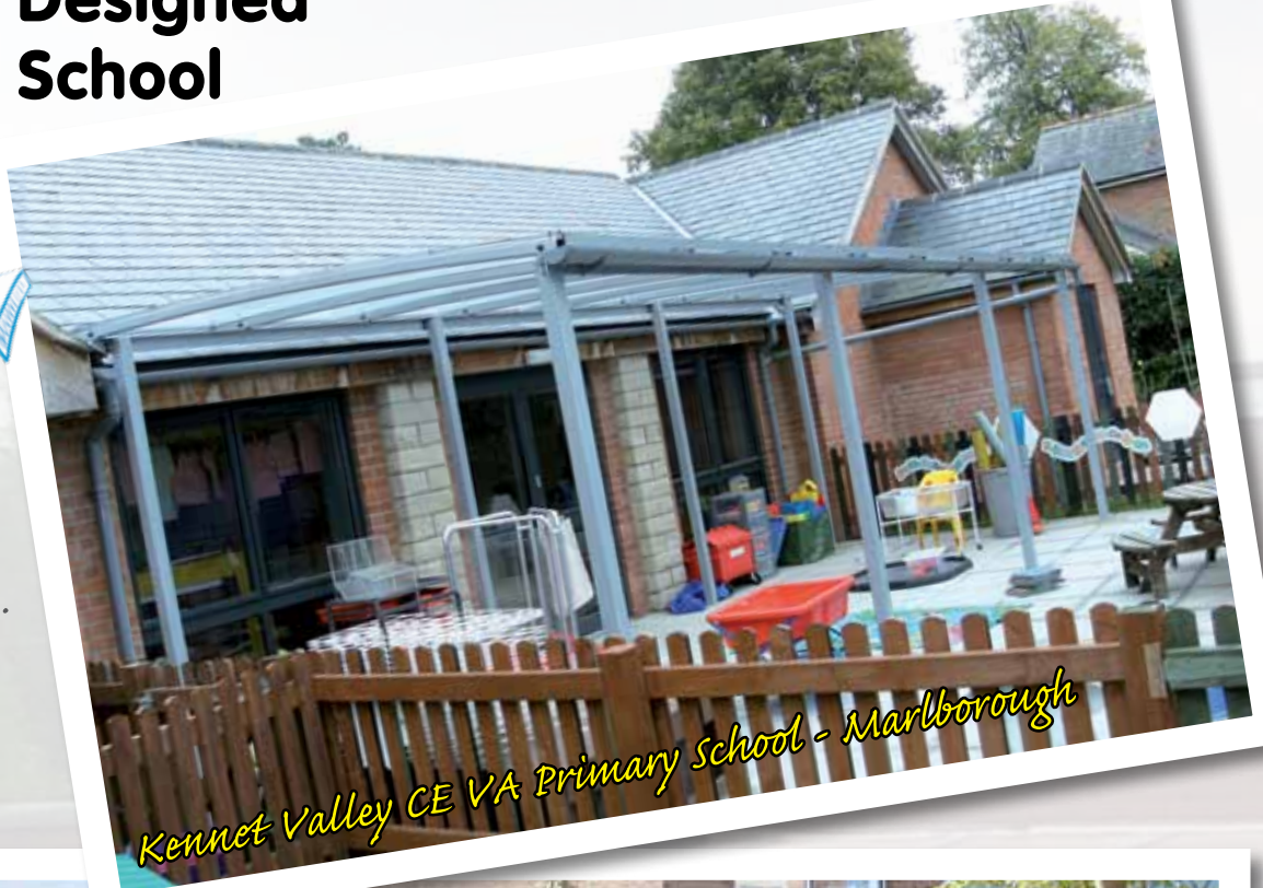
Kennet Valley CE VA Primary School - Marlborough