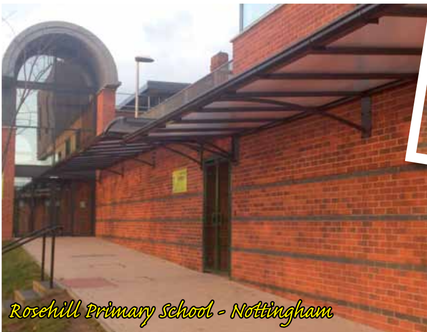
Rosehill Primary School - Nottingham