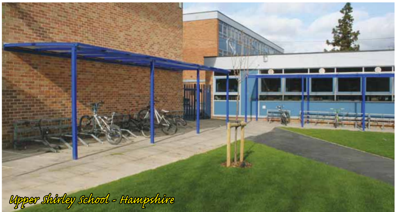
Upper Shirley School - Hampshire