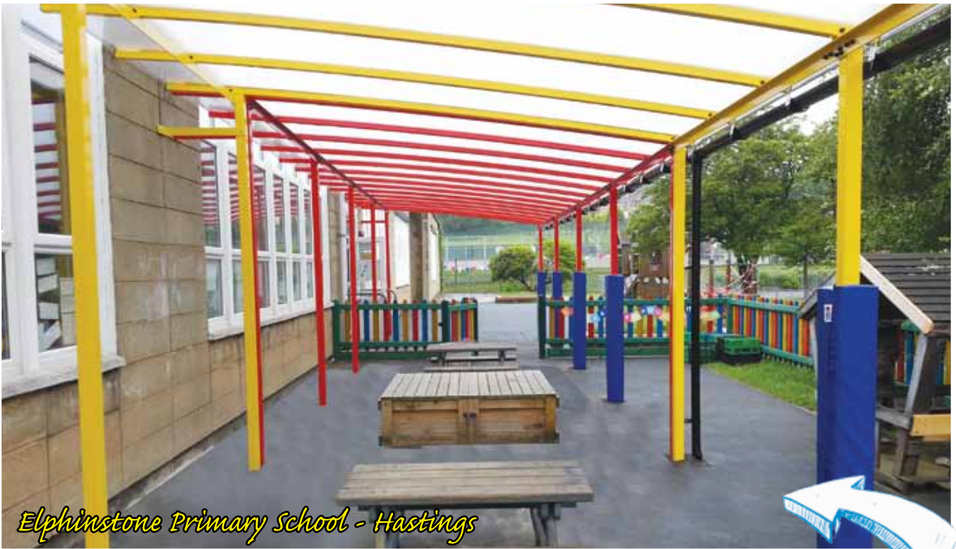
Elphinstone Primary School - Hastings