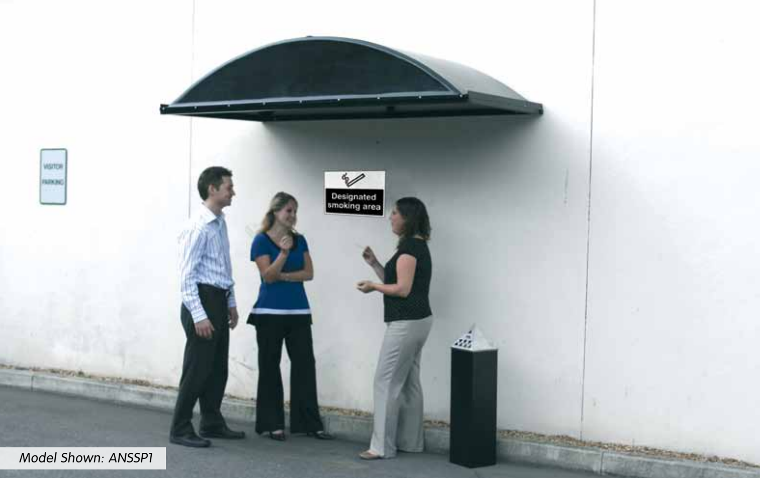
Model Shown: ANSSP1