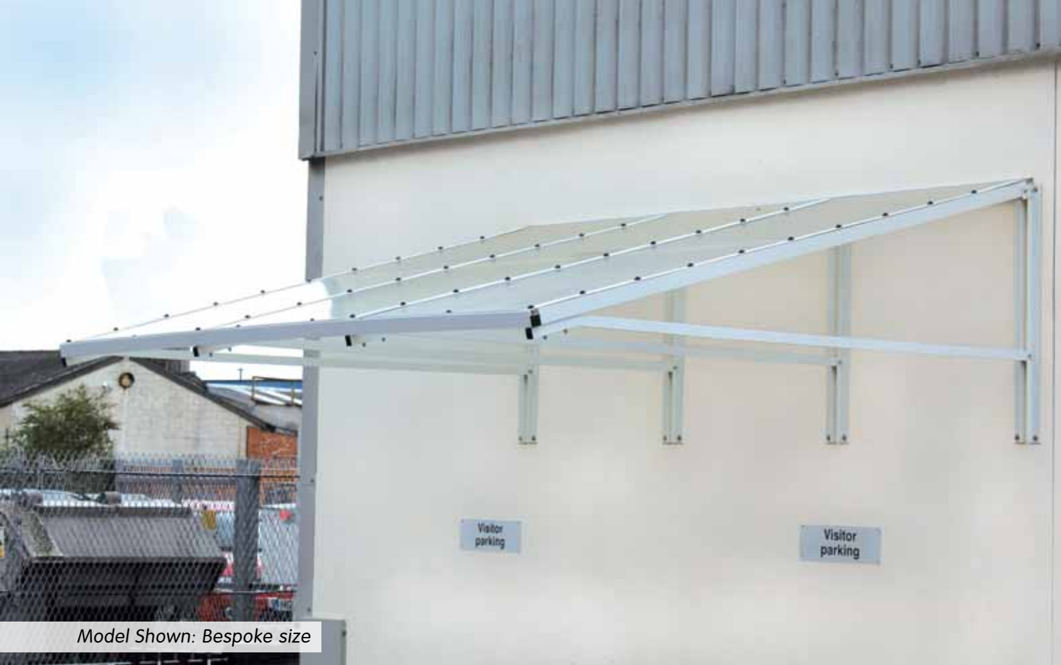
Model Shown: Bespoke size