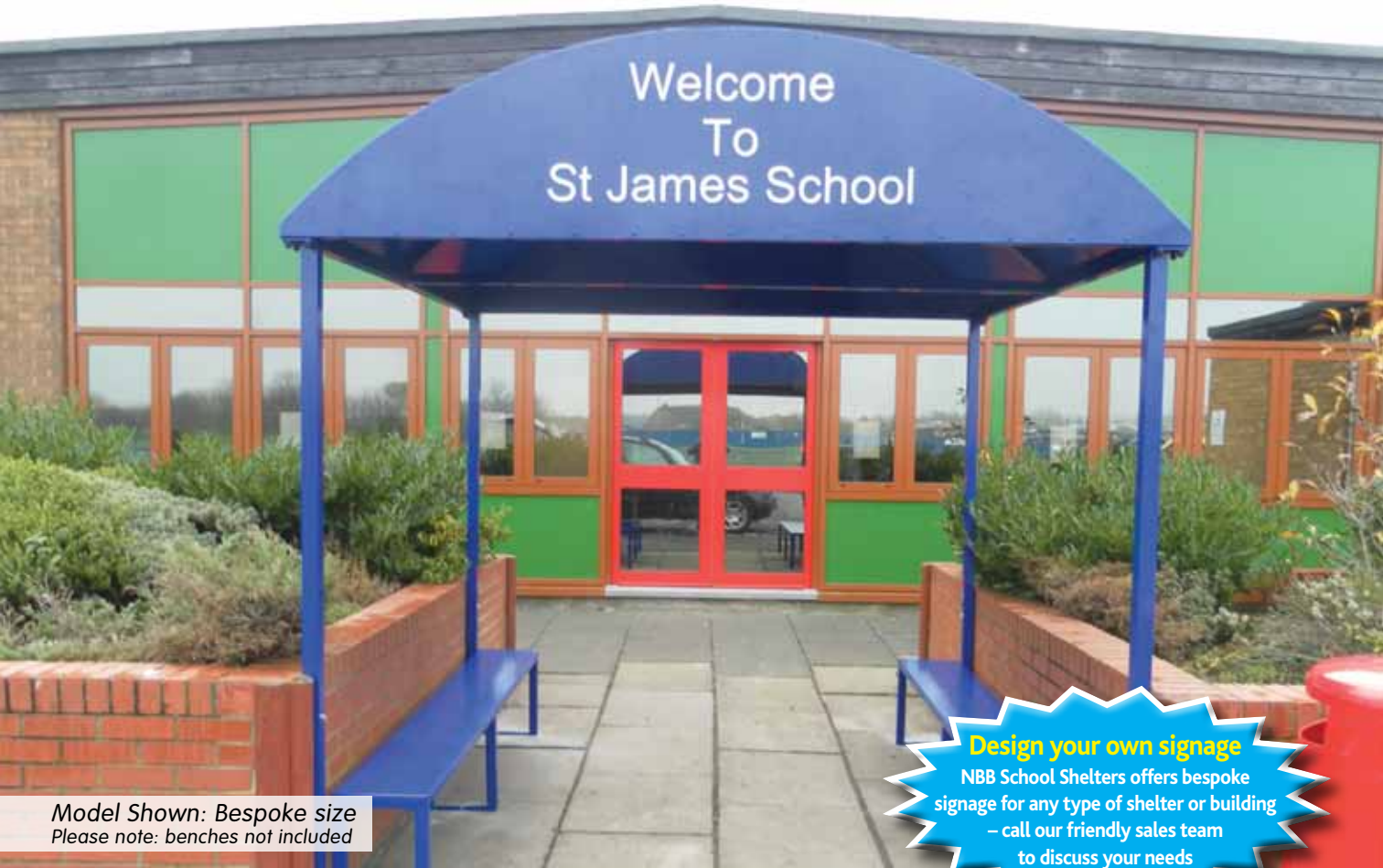
Model Shown: Bespoke size Please note: benches not included

Design your own signage NBB School Shelters offers bespoke signage for any type of shelter or building – call our friendly sales team to discuss your needs