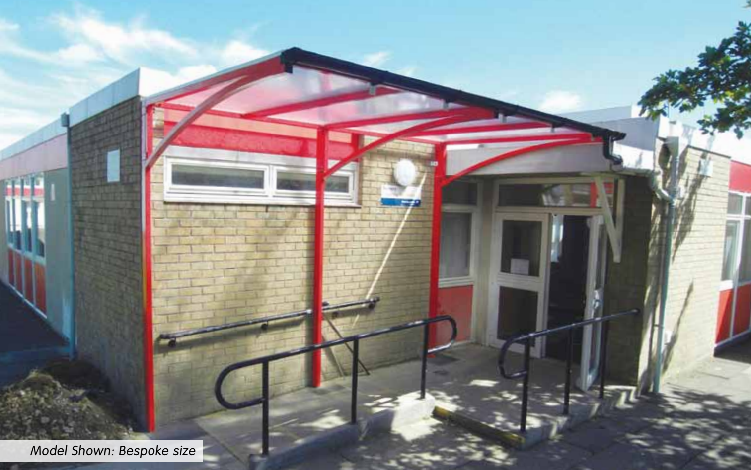
Model Shown: Bespoke size