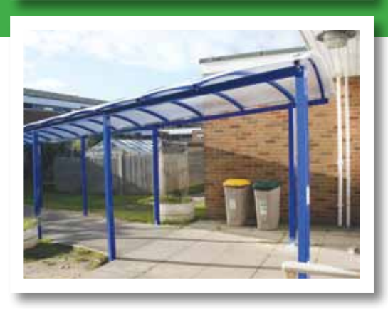
We can design, manufacture and install any size walkway...

"NBB worked closely with the academy to ensure the covered walkway fully met the needs of the new Sixth Form" - Bursar